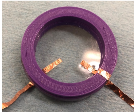
Figure 3. attaching copper tapes