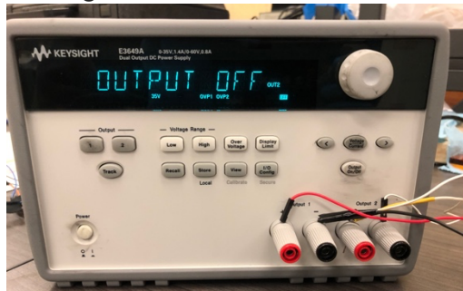
Figure 5. Power supply