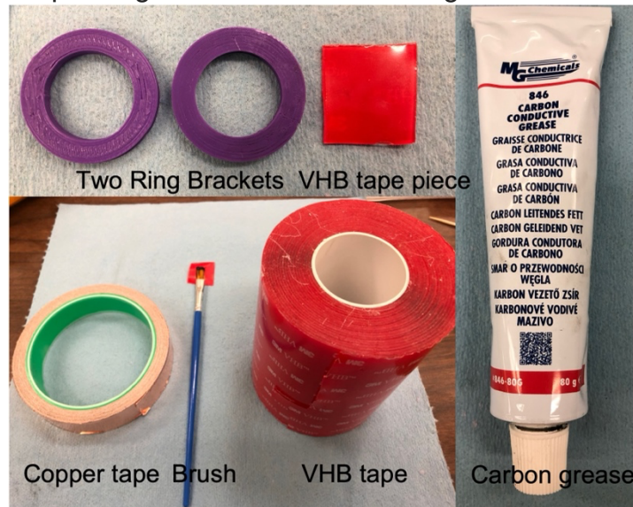
Figure 1. Items for fabrication of dielectric elastomer actuators